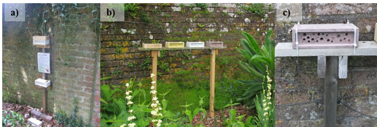
Figure 1 a) Testing the height of the bricks. Note that in this picture the wooden control is at top height, but this was varied between sites; b) bricks of three different colours: white, red and yellow and wooden control, at one site; and c) red brick with occupied cells.

To confirm the presence of solitary bees at each site, a 1 km transect count of solitary bees foraging or flying was carried out twice at each of the sites during May and June 2016. The habitat varied around each transect but was typical of that in the surrounding area; for example, along paths and pavements in urban areas or through ornamental gardens and surrounding rural habitats in public garden sites. Each transect had the experimental nesting sites at the centre, extending approximately east and west of the site and were mapped in advance, following roads and pathways. Bees observed within 1 m either side and 2 m above the transect were either identified on the wing or caught and identified to species following Falk & Lewington (2015). The transects were carried out between 10.00 h-16.00 h on days with temperatures above 15°C and wind speed below Beaufort scale force 4.