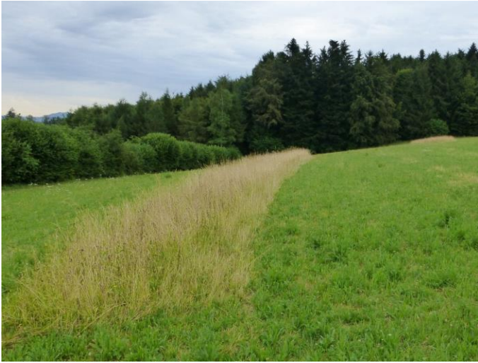
Figure 1. An extensively managed meadow in the Swiss lowlands showing an area of uncut grass left behind after mowing operations. The picture was taken in mid-July, about one month after meadow mowing.

out in extensively managed meadows located at 12 lowland sites spread across the Swiss Plateau (see Buri et al. 2014, for details on study sites). Study sites were more than 5 km apart and comprised two meadows each, which were more than 440 m from each other. The study meadows had been registered as BPA since at least 2004 and had an area greater than 3000 m 2 .