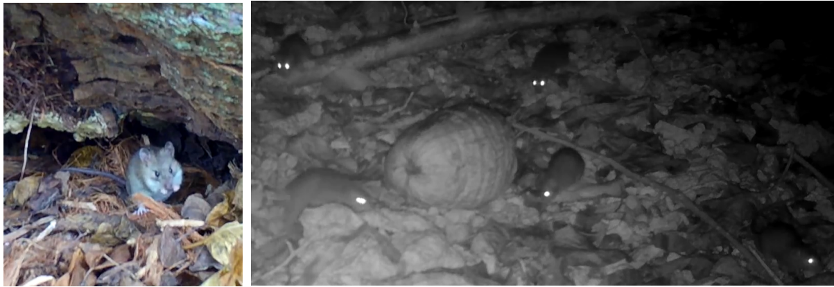
Figure 1. Rat images from the YouTube video A successful Pacific rat eradication on tropical Reiono Island . Left: Pacific rat foraging outside its burrow during the day. Right: five rats foraging at night.

The goal of baiting every potential rat territory was in practice treated as baiting every square metre of the island. This was the effort required to meet the eradication principle of exposing all rats to poison bait under the local conditions of high land crab interference (i.e. crabs consuming bait). Each bait application consisted of a thorough distribution of bait across the grid and an additional, overlapping application along the perimeter, covering 100% of all vegetated areas in one day. Sandy beaches with no vegetation remained unbaited to minimise potential non-target impacts. Rats use sandy beaches as foraging grounds, but their burrows are located in vegetated parts of the island. No bait was applied in the forest canopy despite the abundance of coconut palms, as this was considered unnecessary (i.e. we assumed all rats forage on the ground regularly). Bait was applied using a 10-person baiting line where each person was spaced 20 m apart, walking parallel transects and stopping every 20 m to apply bait to successive 20 m × 20 m (400 m 2 ) areas. Baiters kept in sight of each other and recorded stops on checklists. The amount of bait per stop per person was measured using calibrated cups to hold 128 g, five cups per stop (640 g/400 m 2 ), i.e. four throws covering ~10 m around the marker (e.g. facing each main cardinal point), then a fifth around the marker (Figure 2).